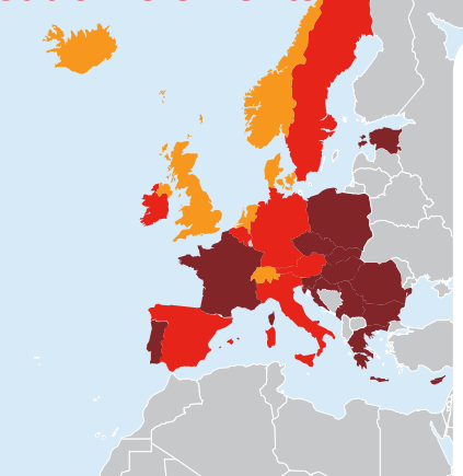
• A key challenge is lack of funding